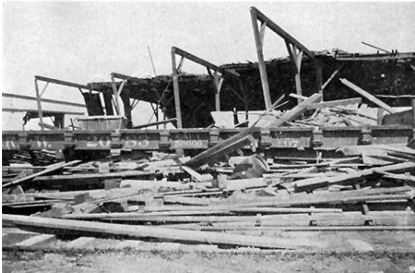
This is a picture of Pier 21 after the storm.

Reflection Questions: Again, <u>imagine yourself back in time! Be sure to answer the following questions from the perspective of a survivor of the hurricane that hit Galveston in 1900.</u>